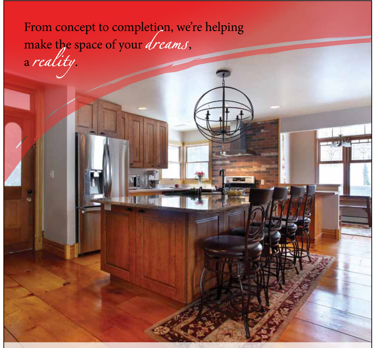
Free 1 hour design consultation for medical newsletter readers!

Specializing in both Residential and Commercial Remodeling for over 25 years